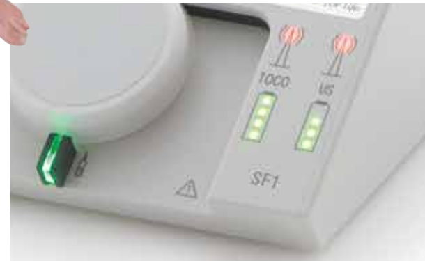
...Freedom from anxiety