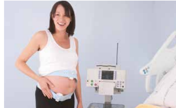
...Freedom to move