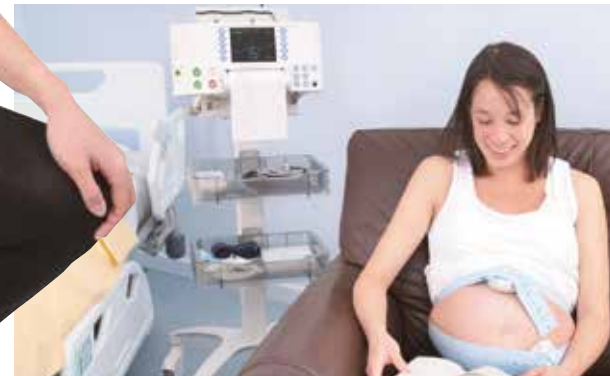
...Freedom from the constraints of a bed